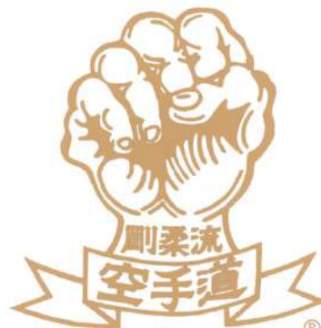
Japan Karate-do ® Goju-Kai Association (J.K.G.A.)